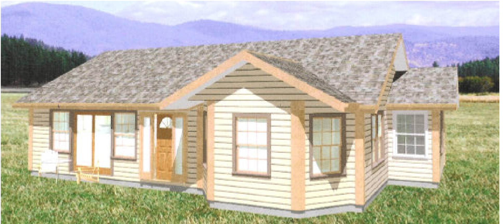
EXTERIOR 3D OVERVIEW